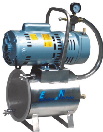
3/4 HP Mini Pump Oil-less System