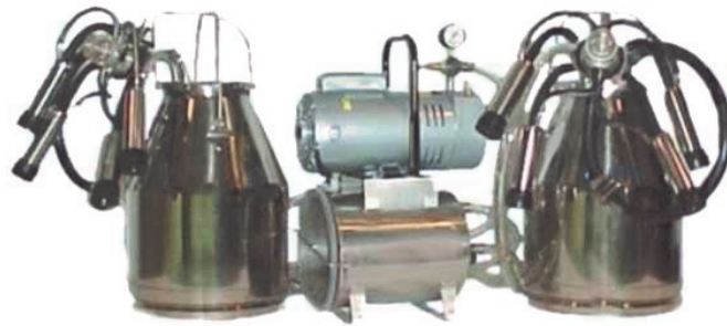
3/4 HP Mini Pump Oil-less System with 2 Complete Pail Milkers