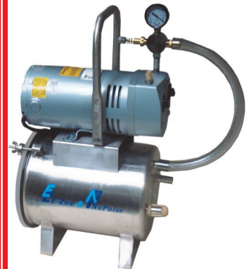
1/4 HP Mini Pump Oil-less System