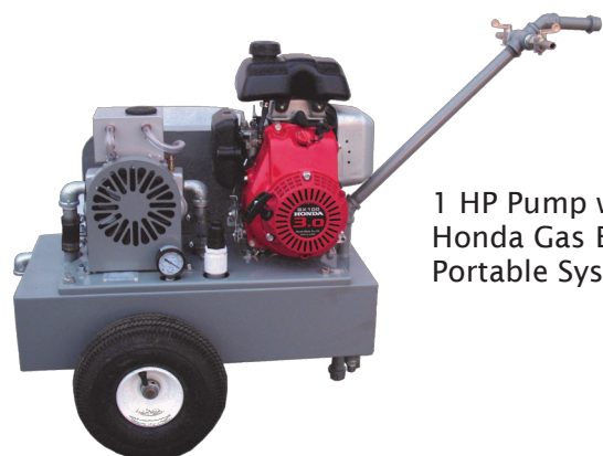
1 HP Pump with 3 HP Honda Gas Engine Portable System